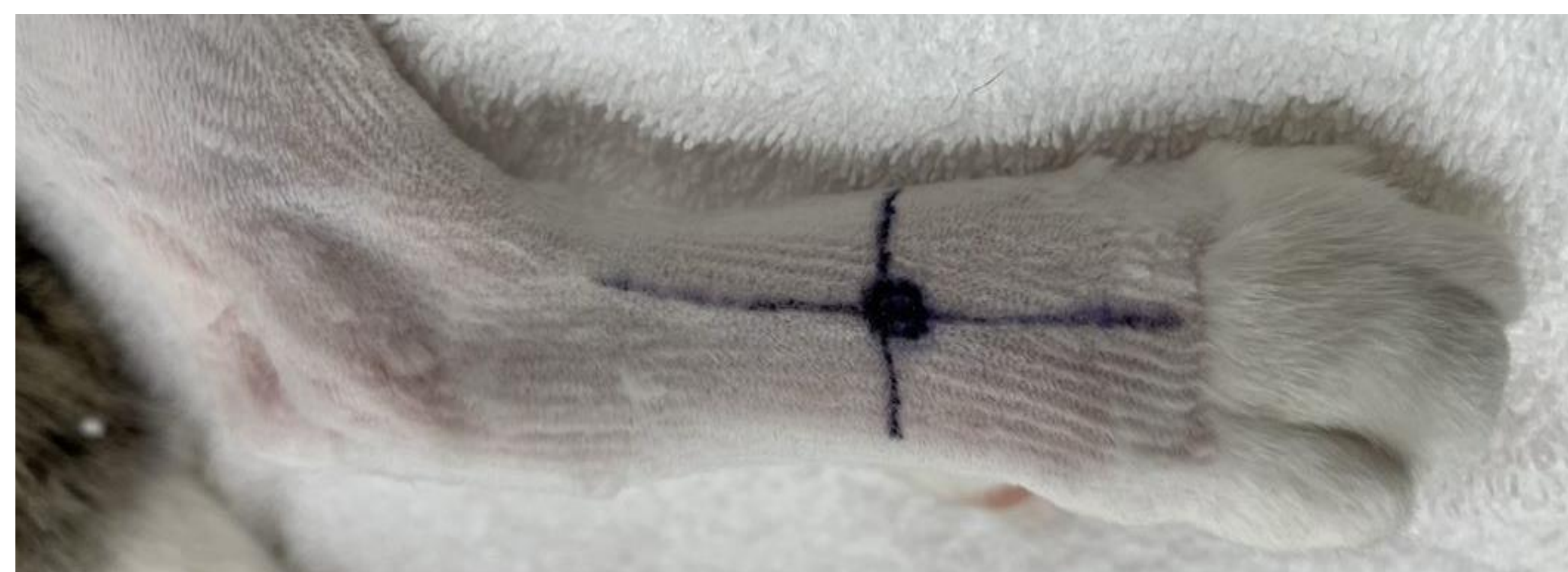
Figure 1: Pelvic limb with simulated tumour and quadrant injection sites drawn with surgical marker.

Methods: Seven healthy 1 year old, male cats were randomly divided into 3 groups with each pelvic limb assigned an injection (either solution A (1mL) or solution B (2mL) of ICG +/- MB). Solutions were injected in 4 quadrants over 30 seconds each, around the simulated tumour on the dorsal metatarsus. The FI was quantified based on the calculation of the corrected total ROI fluorescence (CTRF) using ImageJ software. Cats were monitored for up to 1-month post-procedure for any adverse reactions.